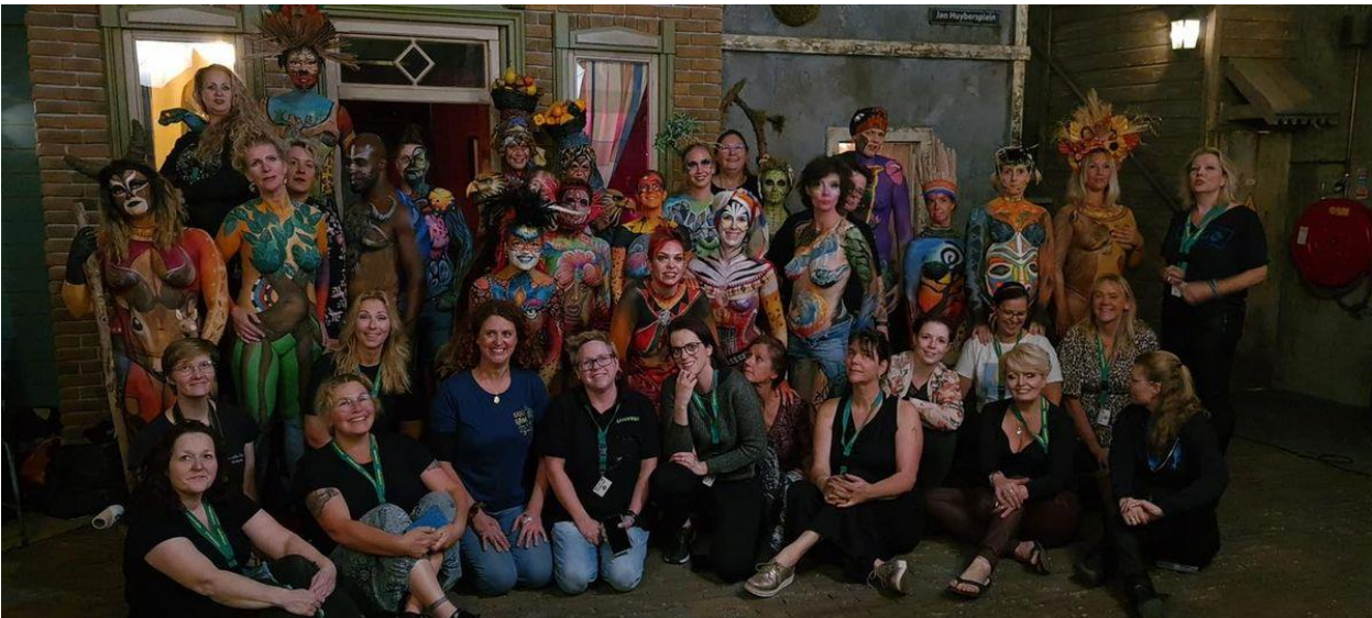
Bodyart for Nature